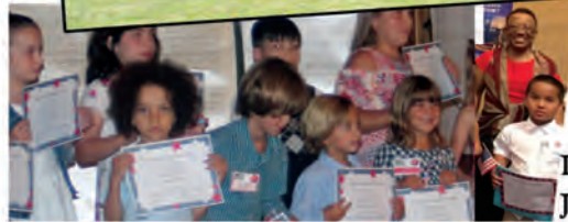
Above: Staff & Campers Left: Jr. Campers

We are proud to announce that our 2021 camp will be held at Singing Hills Christian Camp in Plainfield, New Hampshire.