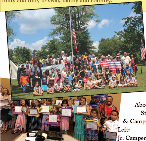
Above: Staff & Campers

Our camp was established to teach principles of life and law, to secure the blessings of liberty to ourselves and to future generations. To that end, we bring together dedicated speakers to inspire our campers, ages 12 to 20, and whole families of all ages. We are volunteers, organized in 2009, with many years of experience. We teach responsibility and duty to God, family and country.